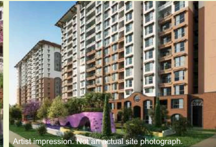
GODREJ MSR CITY

RERA No: PRM/KA/RERA/1251/446/PR/090123/005605