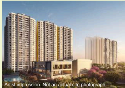
GODREJ LAKESIDE ORCHARD

RERA No: PRM/KA/RERA/1251/446/PR/170524/006882, PRM/KA/RERA/1251/446/PR/170524/006888